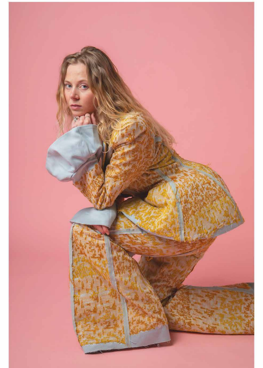
Knitted Suit & Knitted Bra

The knitted suit is made up of two types of fabric. The knitted element is cream cotton yarn paired with two shades of gold yarn used in a punch card technique to create this pattern. This 7 gauge knitted fabric is then beamised onto blue wool/silk to create a strengthened knitted fabric. Exposed seams highlight the two fabrics and frame the curvaceous shape. Paired with a pink linen bra, knitted on the 10 gauge, in a ribbed knit to form around the body.