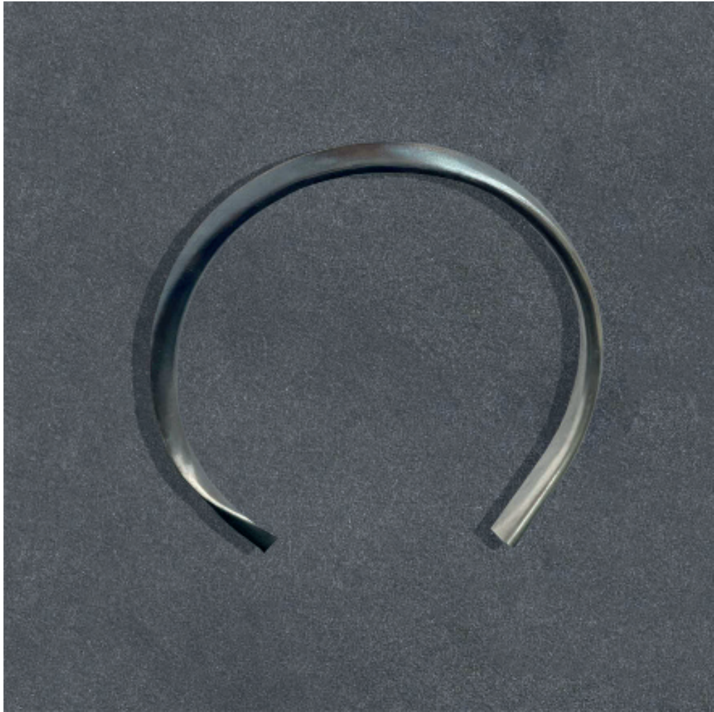
Asymmetric Bangle Silver 69 x 60mm £375