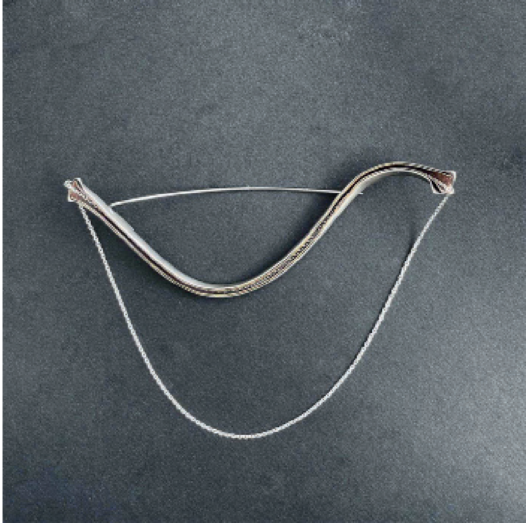
Inner Beauty Brooch Silver and Brass 87 x 64mm (with chain) £295