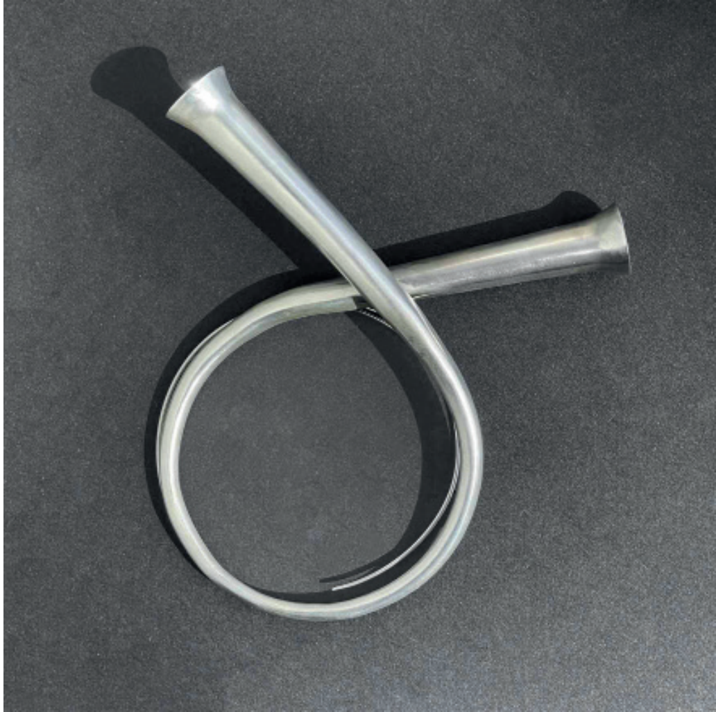
Faux Bells Brooch Silver 83 x 85mm £435