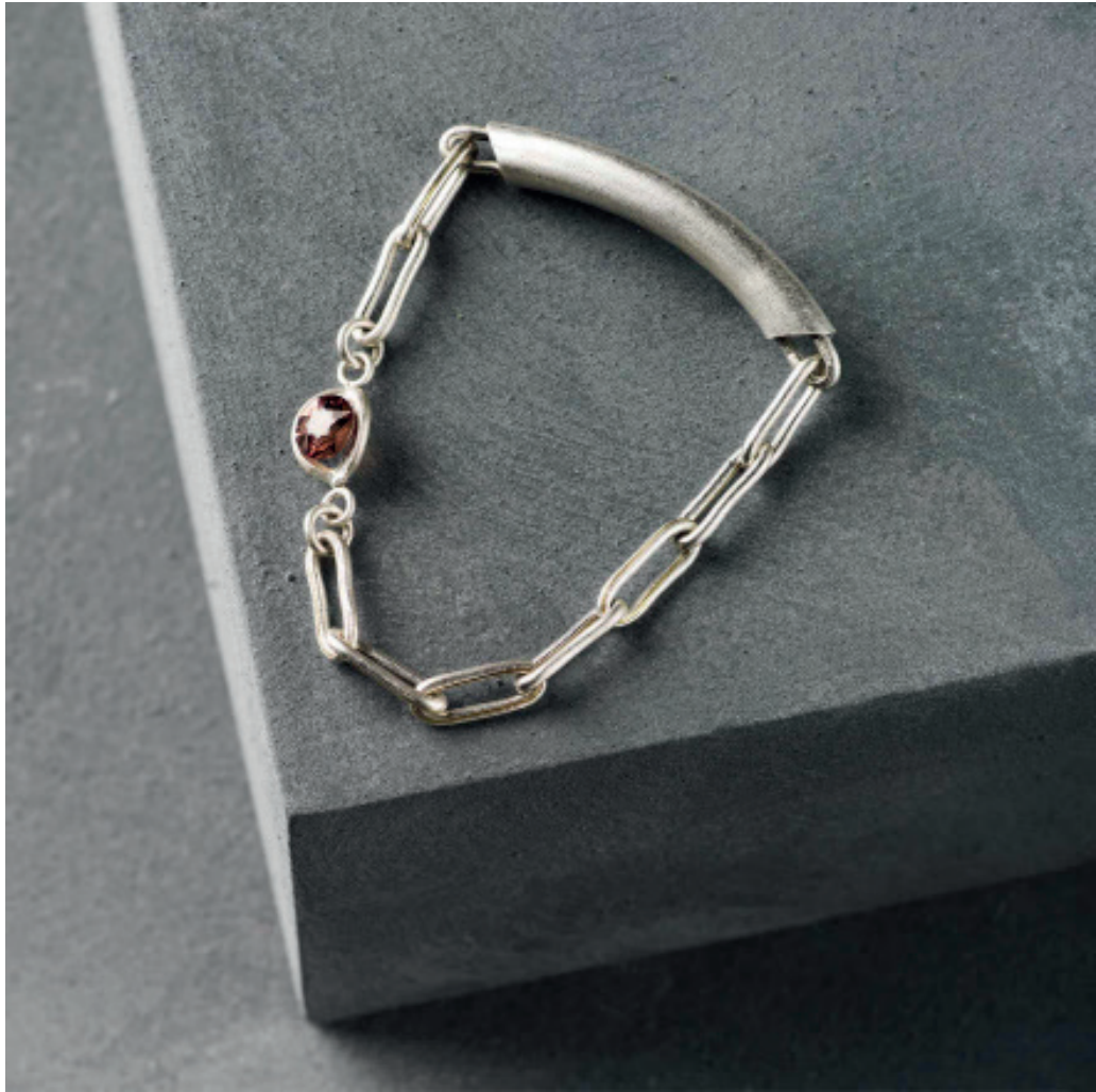
Twisted Tension Brooch Silver, Brass, Zircon 43 x 54mm £495