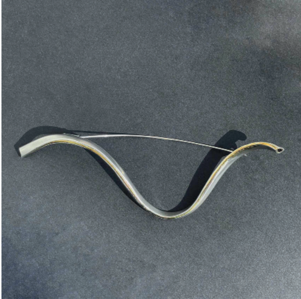
Exposed Brooch Silver and Brass 121 x 36mm £295